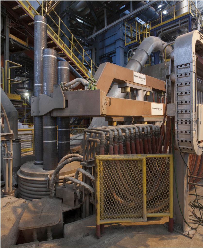
Twin-ladle furnace built by SMS group.

SMS group is a group of companies internationally active in plant construction and mechanical engineering for the steel and nonferrous metals industry. It has some 13,500 employees who generate worldwide sales of more than EUR 3 billion. The sole owner of the holding company SMS GmbH is the Familie Weiss Foundation.